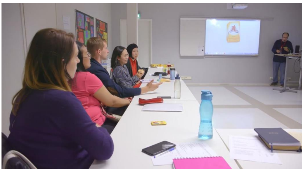
KOTO-SIB programme participants attending Finnish language classes

The SIB programme is expected to generate savings for the government, which could be paid back to the investors, if the project is successful in meeting its goals. The thorough preparation process, which preceded the launch of Koto-SIB, was curated by the Finnish Innovation Fund Sitra. According to the latest available information, a total of 2,217 immigrants participated in the Koto-SIB programme, of which 1,062 were employed by the end of 2020. Of the participants, 1,692 received training for 70 days, at least. More than 50% of those who completed the training were employed.