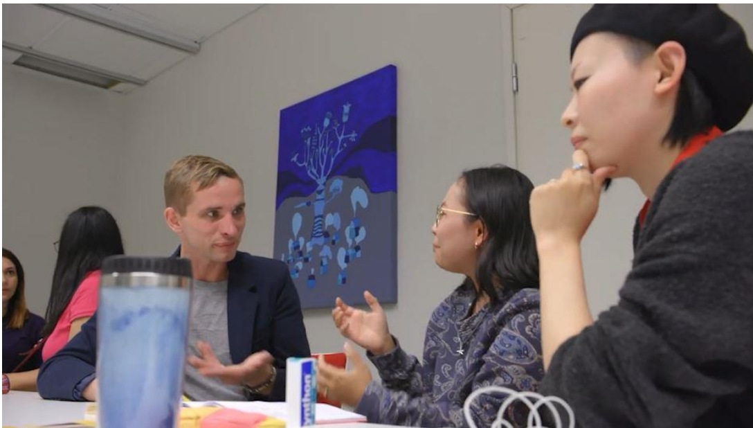
KOTO-SIB participants during a Finnish language class in Helsinki

In addition, a bonus amount is recognised by MEE to the Koto-SIB Fund for each immigrant who has completed 70 days of integration training, in accordance with the criteria of the compulsory training for immigrants. Although this compensation corresponds to around one third of the market price typically paid by the MEE to service providers, to a small extent it serves as a form of capital protection for investors in the programme, and, on the other hand, leads to further savings for the government.