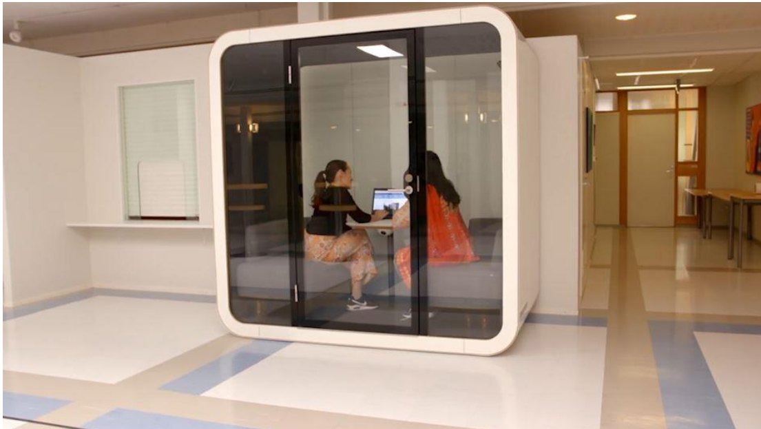
A job coach assists a KOTO-SIB participant in the preparation of a job application

participants of the Koto-SIB programme. The programme manager was in charge of identifying, selecting and subcontracting the service providers and promoting collaboration between them in order to achieve best possible outcomes. MEE was not involved in the selection of the service providers and, since the programme manager is a private sector entity, there was no need to run a public procurement procedure to select service providers. The programme manager selected service providers at its discretion and was able to adjust the number of the service providers throughout SIB implementation period in line with project needs.