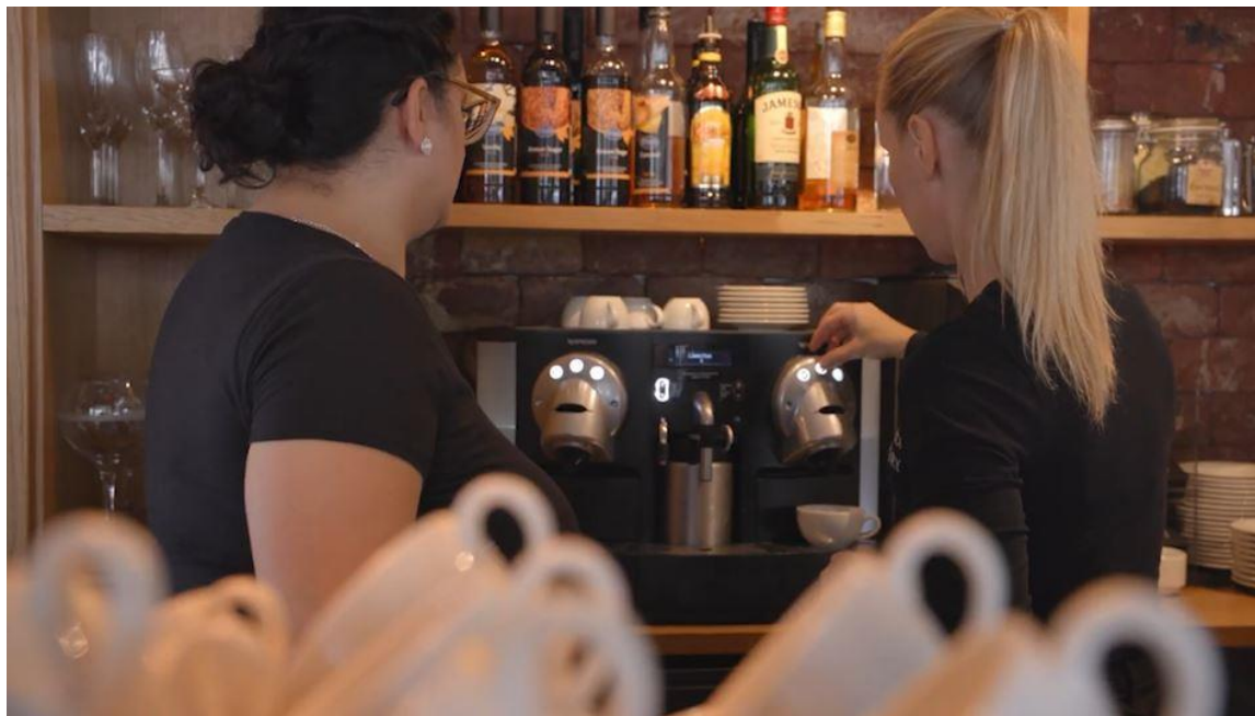
KOTO-SIB participant during her on-the-job training

An external evaluation is expected to be commissioned by MEE in 2021-2022 in order to assess the impact of the SIB programme and the total achieved savings for the government. As of end-2020, the estimated savings amounted to approximately EUR 15-20m since programme inception.